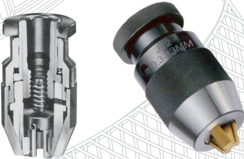
S Type Special Heavy duty model #122